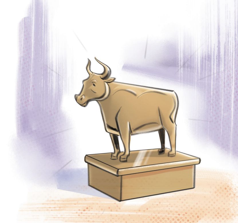
Image of Gold Only one of the silhouettes here has the same details as the golden calf. Can you tell which and spot the differences in the others?

How Did It Happen? Number the events from Exodus 32 in the order they happened.